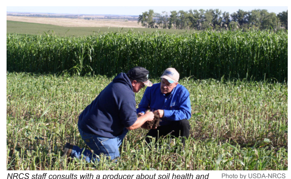
NRCS staff consults with a producer about soil health and conservation.

Together, these programs and incentives protect Nebraska's natural resources and enhance agricultural land. For more information, please visit your local USDA Service Center, check us out on the web at www. ne.nrcs.usda.gov, or follow us on Twitter at @NebraskaNRCS.